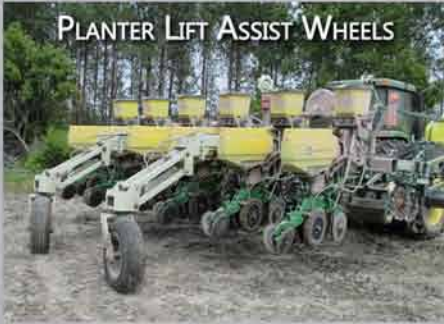
PLANTER LIFT ASSIST WHEELS