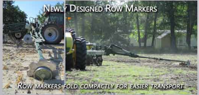
NEWLY DESIGNED ROW MARKERS

ROW MARKERS FOLD COMPACTLY FOR EASIER TRANSPORT