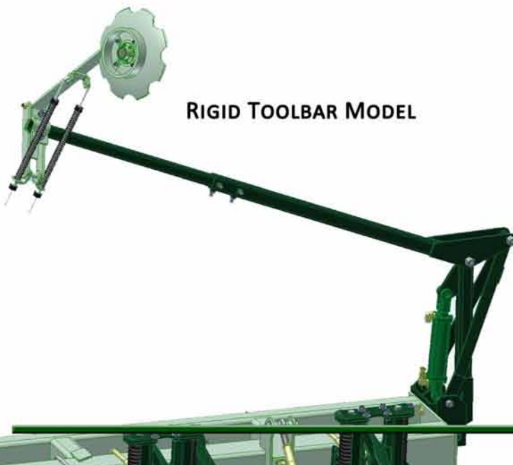
RIGID TOOLBAR MODEL

(NOT FOR USE WITH PREVIOUS MODEL TOOLBARS)