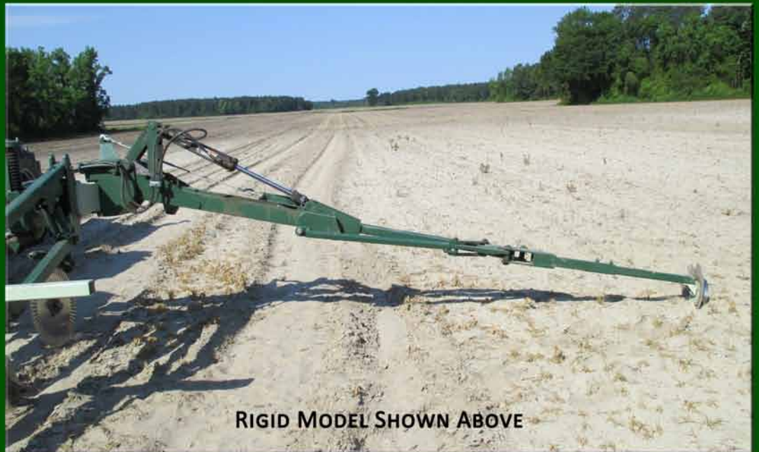
RIGID MODEL SHOWN ABOVE