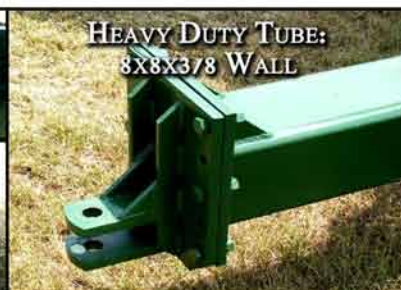
HEAVY DUTY TUBE: 3/8X3/8 WALL