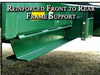
REINFORCED FRONT TO REAR FRAME SUPPORT