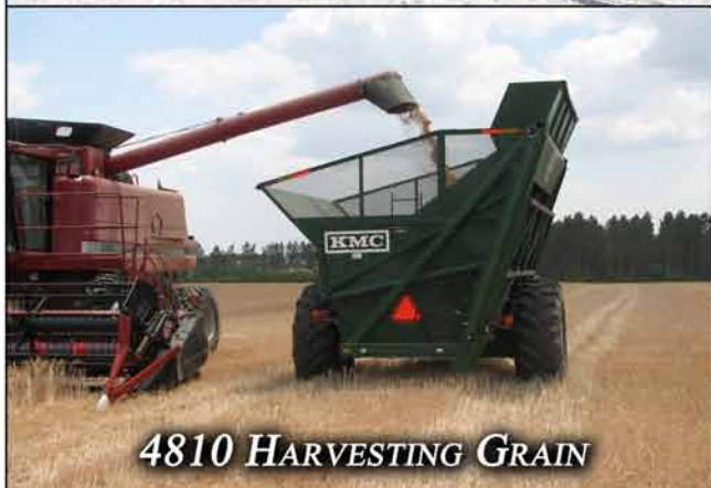
4810 HARVESTING GRAIN