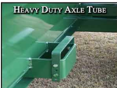
HEAVY DUTY AXLE TUBE

TEAM UP WITH A KMC 4 OR 6 ROW UNLOAD-ON-THE-GO COMBINE AND YOU'VE GOT ONE OF THE WORLD'S FASTEST SYSTEMS FOR PEANUT HARVESTING. UP TO TWO FULL COMBINE LOADS CAN BE EMPTIED VIA HYDRAULIC CONVEYOR INTO THE DUMP CART AND TRANSPORTED TO DRYER WAGONS OR SEMIS, WITH NO STOPPING OR LOSS OF TIME FOR DUMPING! DUMPING HEIGHTS UP TO 16'1" ALLOWS UNLOADING INTO EITHER TYPE OF CONVEYANCE AND THE DUMP CHUTE EXTENDS WELL INTO EITHER FOR UNIFORM LOADING AND LESS SPILLAGE RISK.