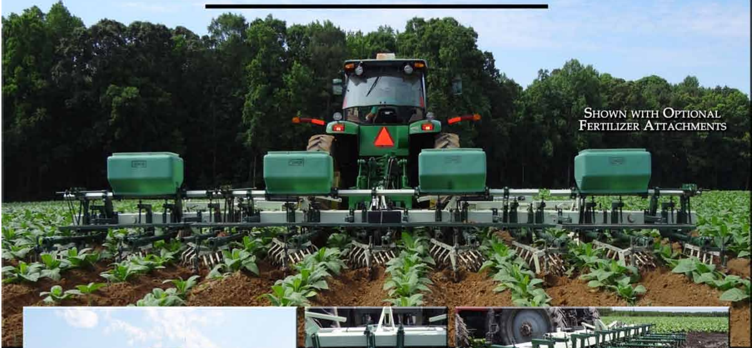
SHOWN WITH OPTIONAL FERTILIZER ATTACHMENTS